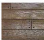
Random Boardwalk 6" Planks*