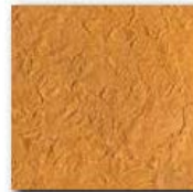
Seamless Sandstone Light