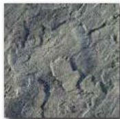
Seamless Blue Stone