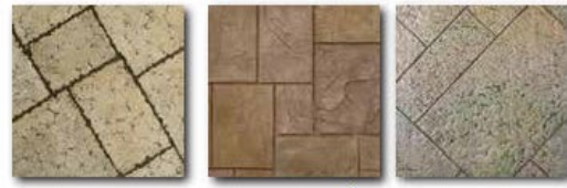
Versailles Tumbled Travertine