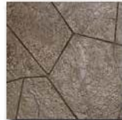
Random Old Granite