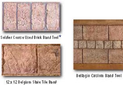
Soldier Course Used Brick Band Tool*