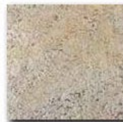
Seamless Quarry Stone