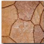
Santa Fe Random Stone Medium