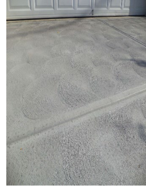
Brushed w/ Sweeps