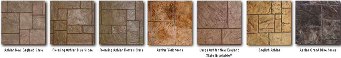
Ashlar New England Slate