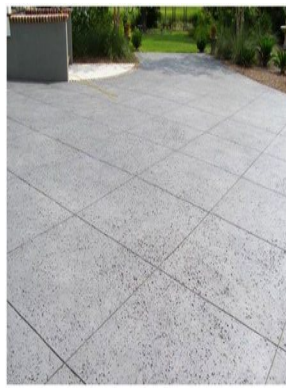
Salt Finish Deck