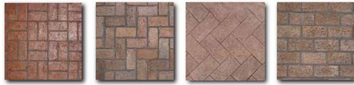
Basketweave Used Brick