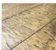
Hand Hewn Timber