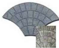
Old London Mermaid Granite