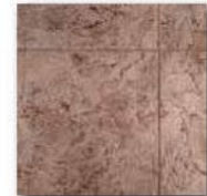
24 x 24 Roman Slate Tile