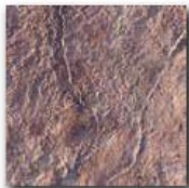
Seamless Old Granite*