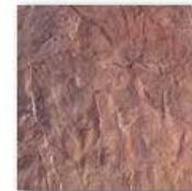
Seamless Italian Slate*