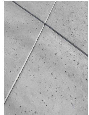
Salt Finish Detail