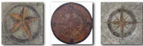
5 Point Star*