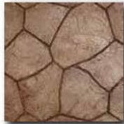
Random Sandstone Hammered Edge*