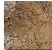
Seamless Blue Ridge*