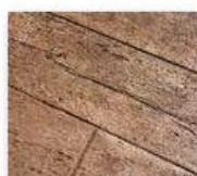
Reclaimed Timber Planks