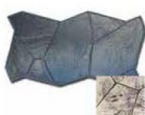
Large Random Flagstone