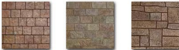
Cut Stone Cobble