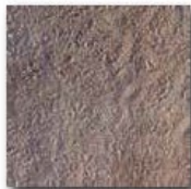
Seamless Flamed Granite