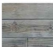
Boardwalk 6" with Knots*