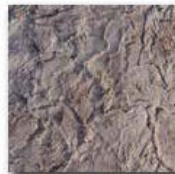
Seamless Roman Slate*