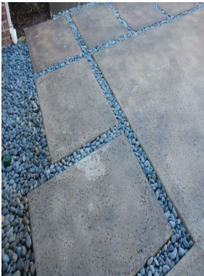
Salt Finish Pads