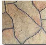
San Diego Flagstone