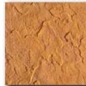
Seamless Sandstone Coarse