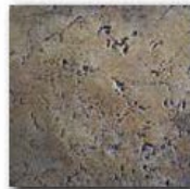
Seamless Travertine Coarse Groutable