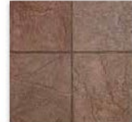
18 x 18 Old Granite Stacked Tile