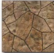
Random Blue Stone*